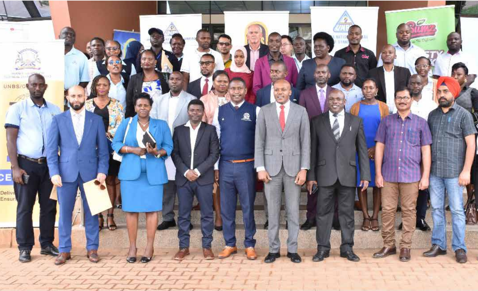
UBTEB gets recognized for obtaining the Quality Management Service certification by UNBS - UNBS Headquarters

As the news of UBTEB's certification spreads, there is renewed hope within the TVET sector that these efforts will result in more opportunities for graduates to thrive. By aligning training with international standards and certifying institutions and programs with the highest quality standards, UBTEB is enhancing the reputation of TVET in Uganda, and creating a brighter future for thousands of young Ugandans ready to take on the world.