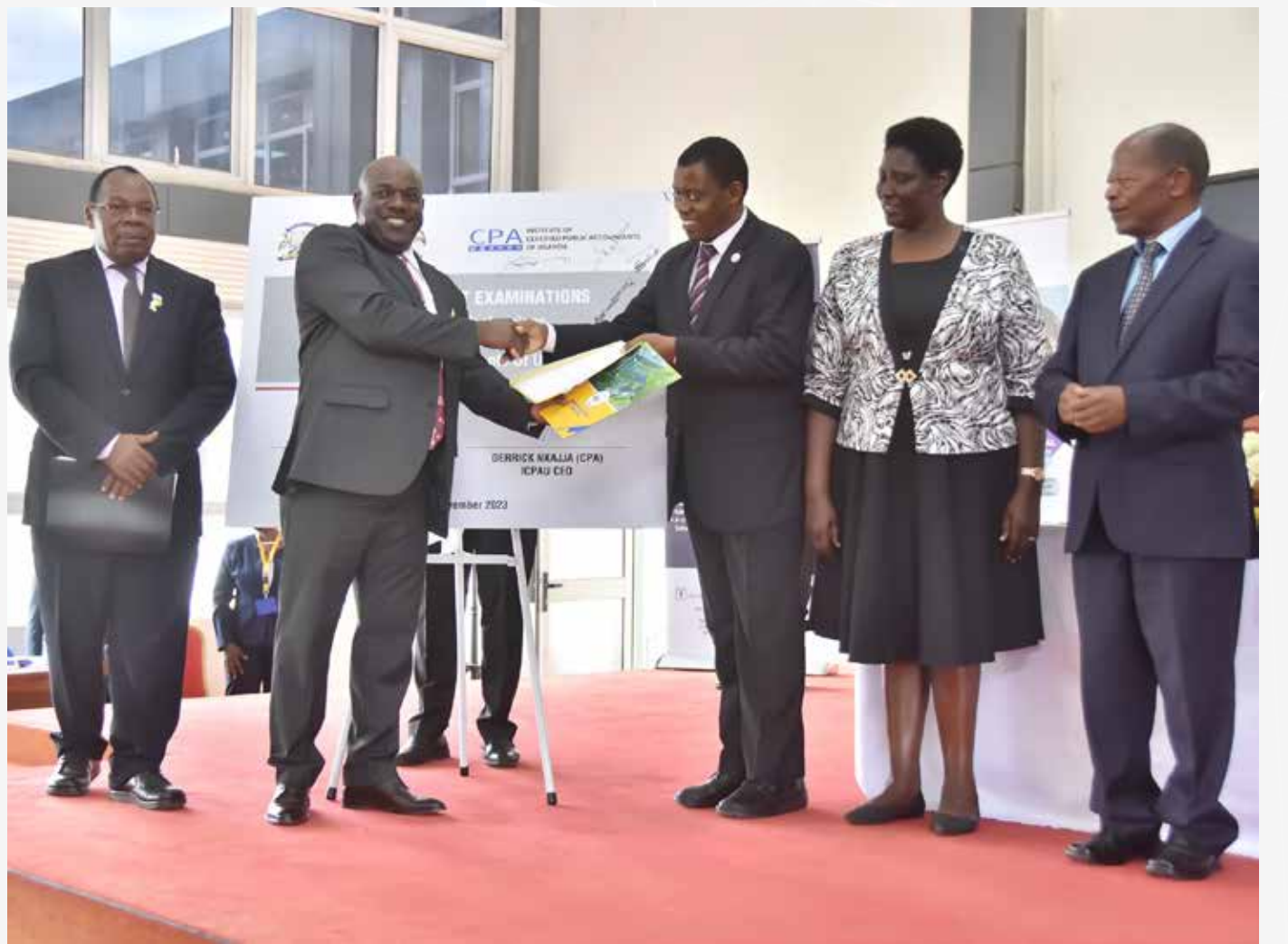
UBTEB signs MOU with The Institute of Certified Public Accountants of Uganda.

The Board has strengthened linkages and partnerships with stakeholders for improved stakeholder engagement and service delivery. In this respect, UBTEB has continuously strengthened industrial training monitoring and assessment, built synergies with partners and assessment/examination bodies/ universities.