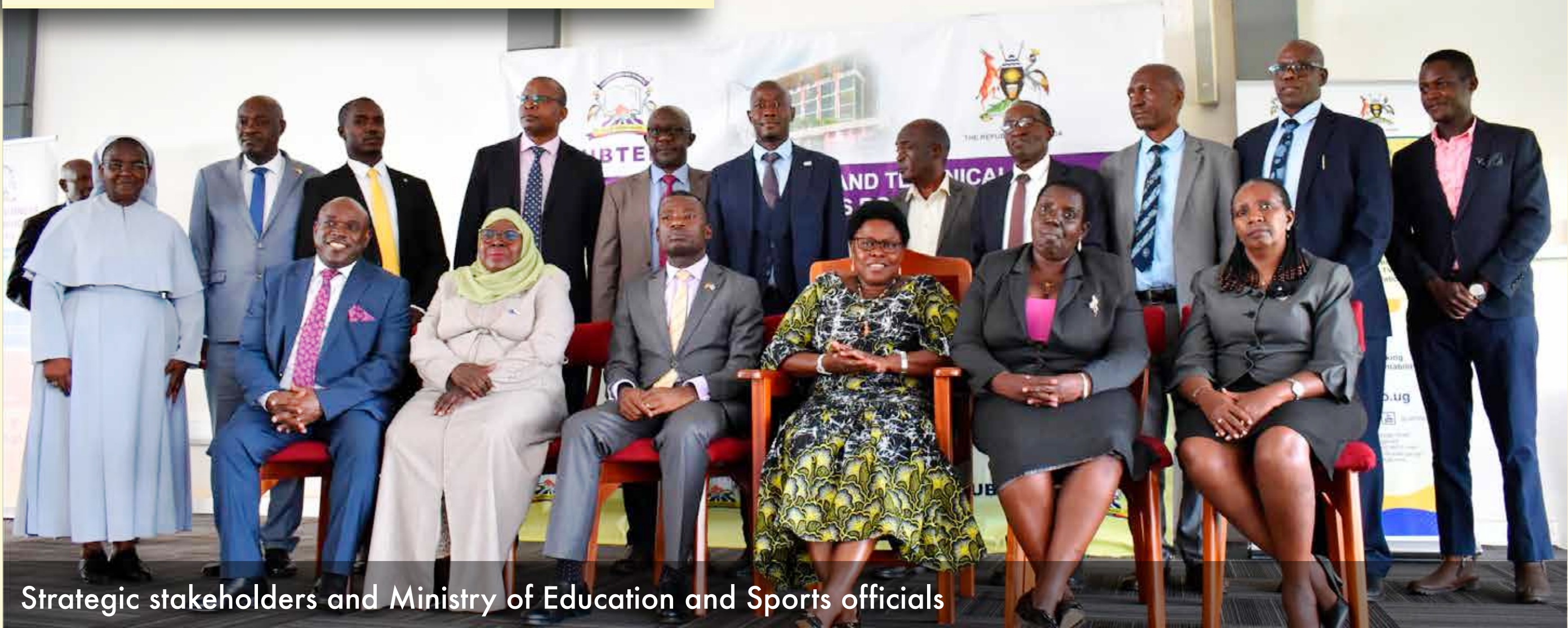
Strategic stakeholders and Ministry of Education and Sports officials