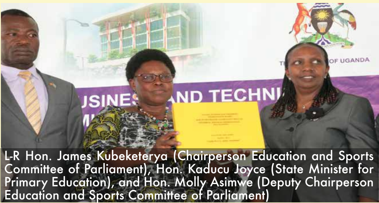
L-R Hon. James Kubeketerya (Chairperson Education and Sports Committee of Parliament), Hon. Kaducu Joyce (State Minister for Primary Education), and Hon. Molly Asimwe (Deputy Chairperson Education and Sports Committee of Parliament)