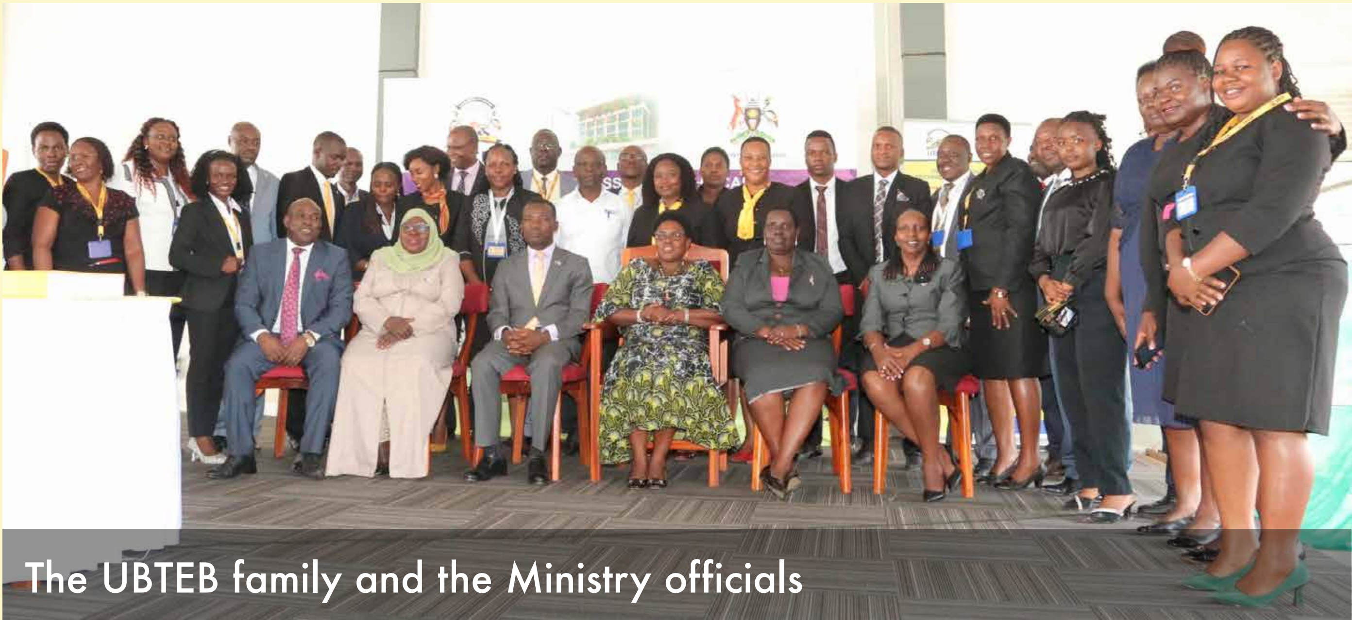
The UBTEB family and the Ministry officials